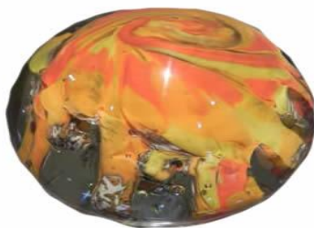
CLOUD 9 COLOURED