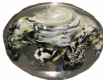
CLOUD 9 COLOURED