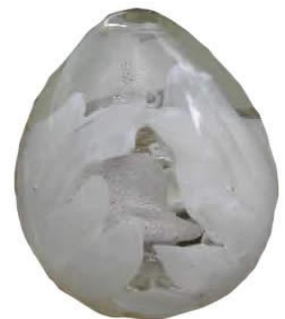
WHITE ANGEL WINGS